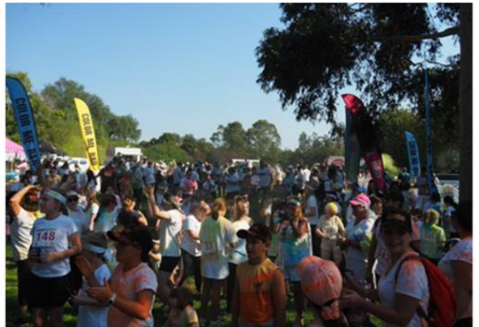
Bairnsdale Apex Club (Vic) – The Colour Ya World event was fun run of 5kms with the throwing of powdered colour along the course and at the finish line. The project aims to bring the community together and promote local running tracks and exercise and improve the quality of family relationships.

APEX CHARITABLE TRUST Grants totalling $118K were made to a range of causes during the year, with the Board looking for practical applications rather than research. The causes of melanoma, diabetes, cancer and autism were supported through grants made respectively to Melanoma Patients Australia, Juvenile Diabetes Research, Tour de Cure, Bloomhill Cancer Care, Yurana Children's Cancer and Aspect. In addition, children's reading and development was supported through a grant to Raising Literacy.