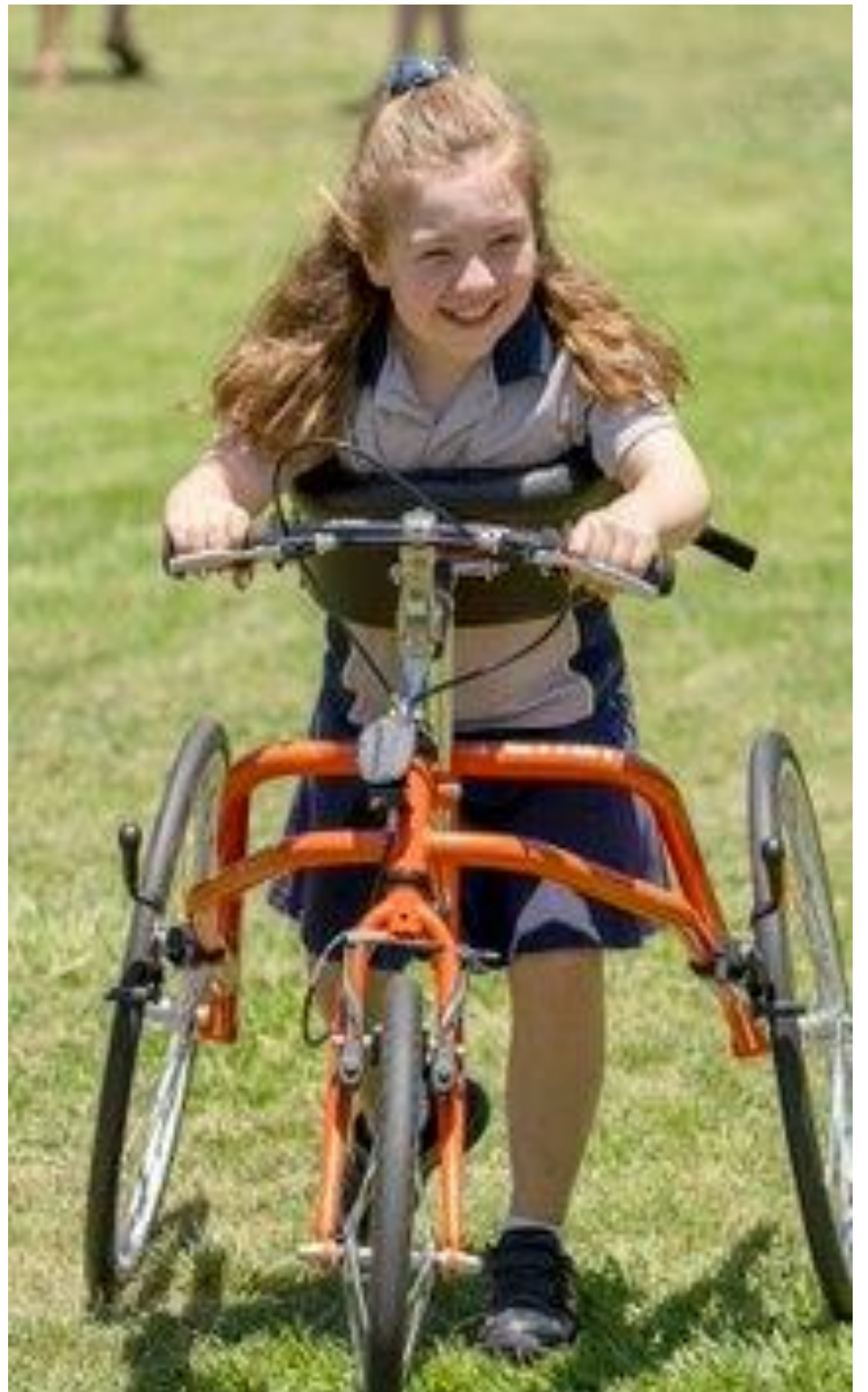
Assisting in the purchase of three wheelers