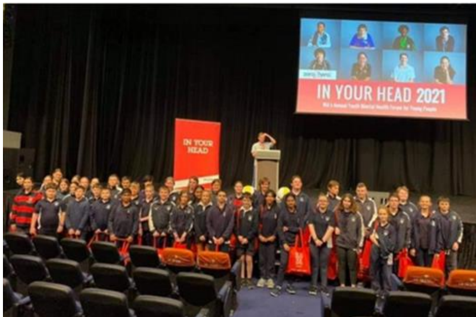
Wongan Hills Apex Club (WA) – A grant was given to the students of Wongan Hills District High School to attend a Youth Mental Health Forum, zero2hero in September 2021