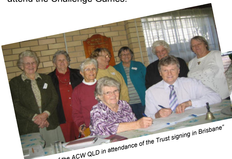
"Members of the ACW QLD in attendance of the Trust signing in Brisbane"

Only in its first year of operation, the Queensland Civilian Widows Trust is already making a difference for disadvantaged QLD youth. Following the devastation of the Floods and Cyclone Yasi, hundreds of primary school students have been supported through the purchasing of uniforms, as well as support with school fees and books. The Trust has also enabled students to attend a youth development camp, as well as meeting the transportation costs for Tully High School students, to attend the Challenge Games.